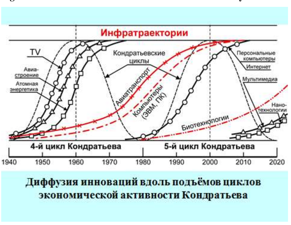
Fig. 8. Diffusion of Innovations in Kondratiev Economic Cycles

new technological achievements. The technological changes will cause changes in the structure of international relations. Countries that will master new technologies earlier than others will acquire competitive advantages in the world market and will begin to sideline the former leaders who will now have to make great efforts to overcome the crisis of capital over-accumulation in outdated industrial and technological structures. Struggle will begin between the new and old leaders of technological and economic development for domination in the world market, which will lead to higher international tensions and military-political conflicts, which have so far led to world wars. It is exactly such a period that is beginning now. It will last until 2020-2022, when the structure of the new technological cycle will be formed and when the world economy will enter a phase of stable growth based on it (Fig. 8).